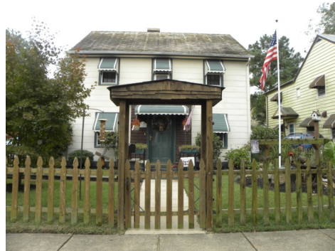
OCTOBER — 22 BURTIS STREET FRANK & CAROL HOBOR