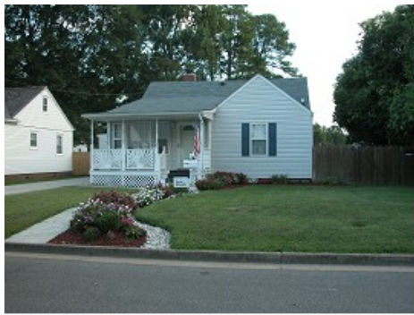
AUGUST — 6 REX STREET JOSH SIMMINAGER